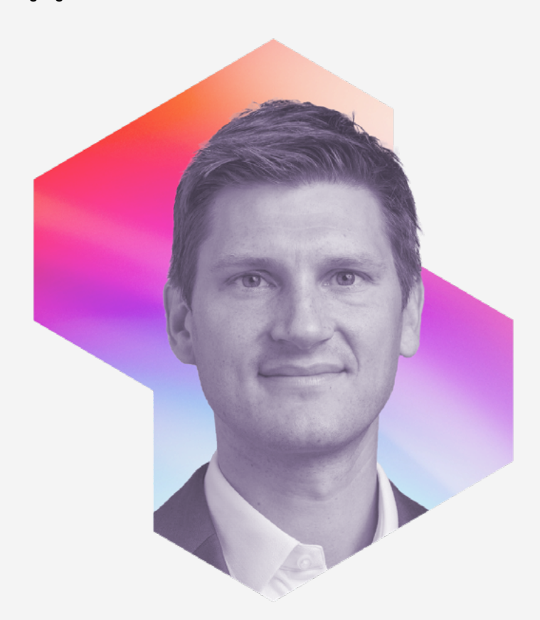
Top 25 Minds Redesigning Financial Services in Switzerland